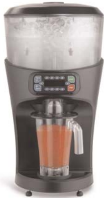
Model HBS1 200